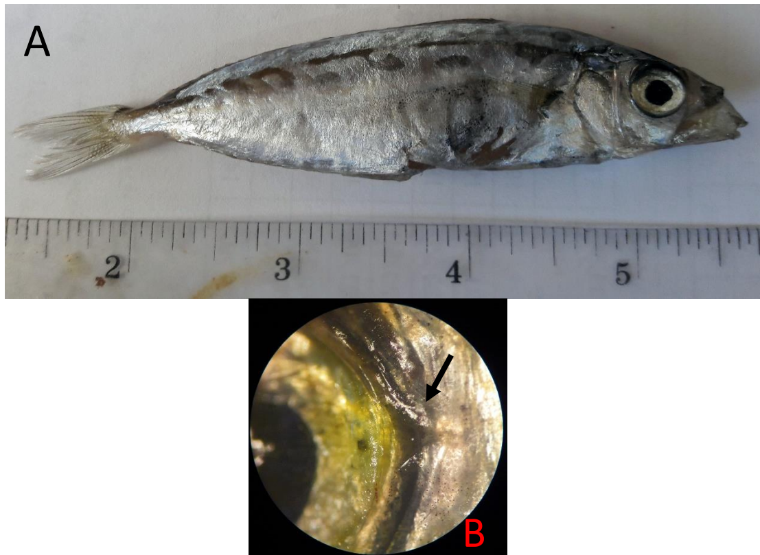
Figure 2. E. popei ; A- Specimen caught on 10-1-2020 from Banyas coast, Syria. B- Deep and sharp the incision on the posterior margin of the adipose eyelid.