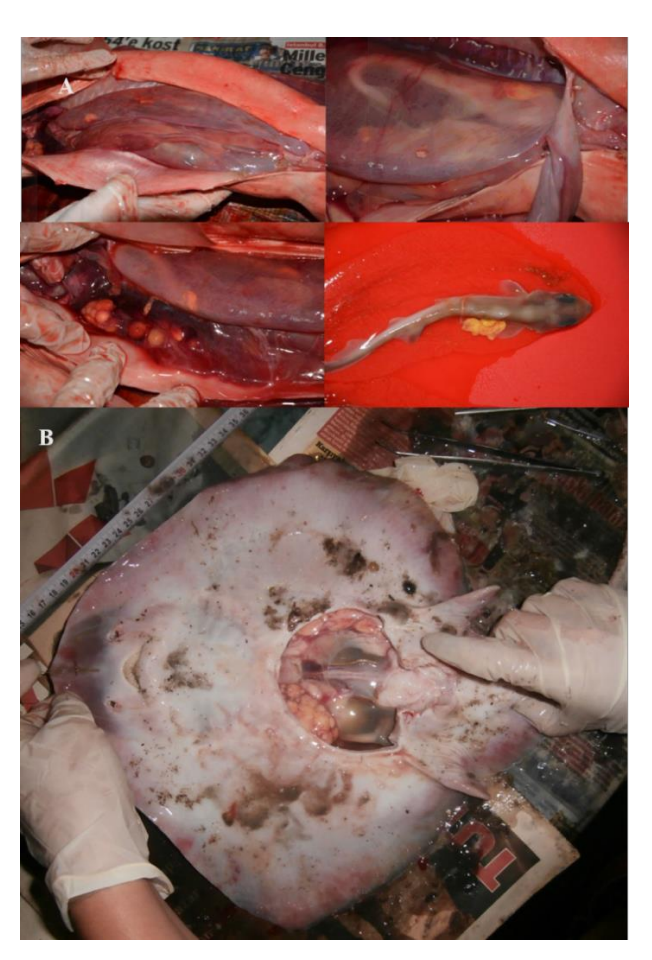
Figure 2. Example photos for pregnant specimens; A. M. asterias embryos, B. R. radula with the egg cases

bony fish remains, secondary crustaceans and/or cephalopods. In batoid or ray species, the main find was observed to be crustacean species, and some mollusks as their body type also suggest, but some bony fishes were also found.