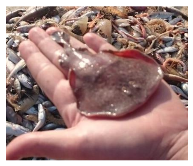
Figure 3. A photo of the neonate T. marmorata

Except two species (S. blainville and D. pastinaca) two I. oxyrinchus, 84 G. cemiculus, two S. squatina, three C. plumbeus, one G. altavela, one M. asterias, one M. aquila, five M. mustelus, six M. punctulatus, one A. bovinus, one R. miraletus, six R. radula, two S. canicula, and two T. marmorata individuals had food items in their stomachs. Though the number of full stomachs was limited and not enough for statistical analyses, it was observed that in the stomachs of shark species, there were mainly