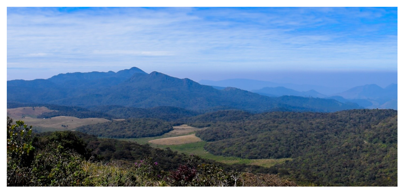
Figure 2. View of the central region of HPNP from the top of Totupola mountain. Grassland habitat and Cloud forest habitats are visible with the backdrop of Kirigalpoththa and Agra mountain ranges

Distance sampling is a popular method for density estimates of different animals (Jenkins et al. 1999, Karsten et al. 2009) and recent literature includes several studies of chameleons (Jenkins et al. 1999; Karsten et al. 2009) as well as a few agamid density estimations (Venugopal 2010). The natural