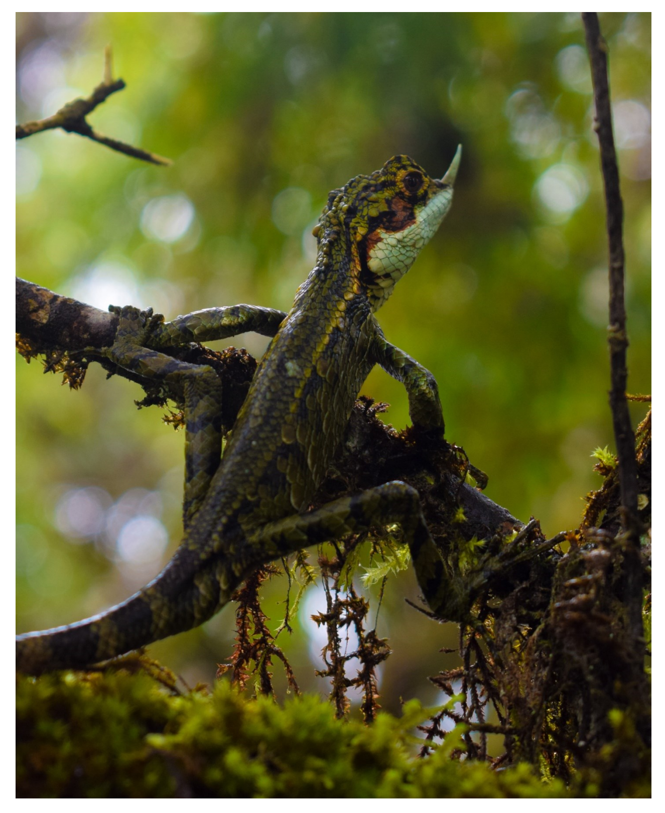
Figure 4. An adult C. stoddartii camouflaged in its preferred Cloud forest microhabitat