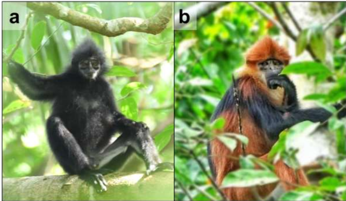
Figure 1. The fur colouration between subspecies of P. chrysomelas . a) Black morph P. c. chrysomelas b) Red morph P. c. cruciger.