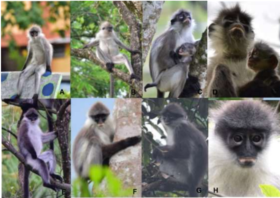
Figure 1. A-D : White-thighed surili in UKM, E-G : White- thighed surili in Genting Highlands & H: Fraser's Hill

morphological analysis of white-thighed surili in Kolej Dato' Onn, UKM. Figure 1 (E-H) shows the the pictures used in morphological analysis of white-thighed surili in Fraser's Hill and Genting Highlands.