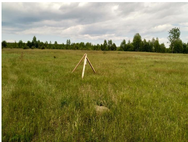
Figure 1. Photos of the studied biotopes in surroundings of the cordon Taratinsky: 1 – river sand banks; 2 – thickets of willows; 3 – glade in the floodplain deciduous forest; 4 – edge of the floodplain deciduous forest - west side; 5 – floodplain meadow; 6 – edge of the floodplain deciduous forest - east side; 7 – floodplain deciduous forest interiors; 8 – edge of the floodplain deciduous forest - north side.