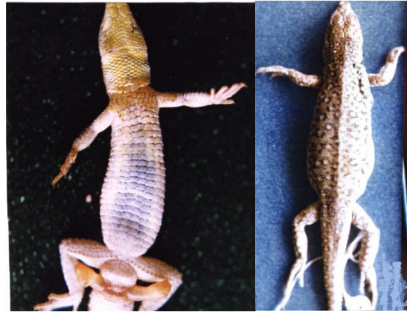
Figure 3. Eremias intermedia ; dorsal view of the adult specimen showing the color pattern and ventral view showing the ventral scales arrangement.

homogeny, sexual dimorphism was analyzed using one-way variance analysis.