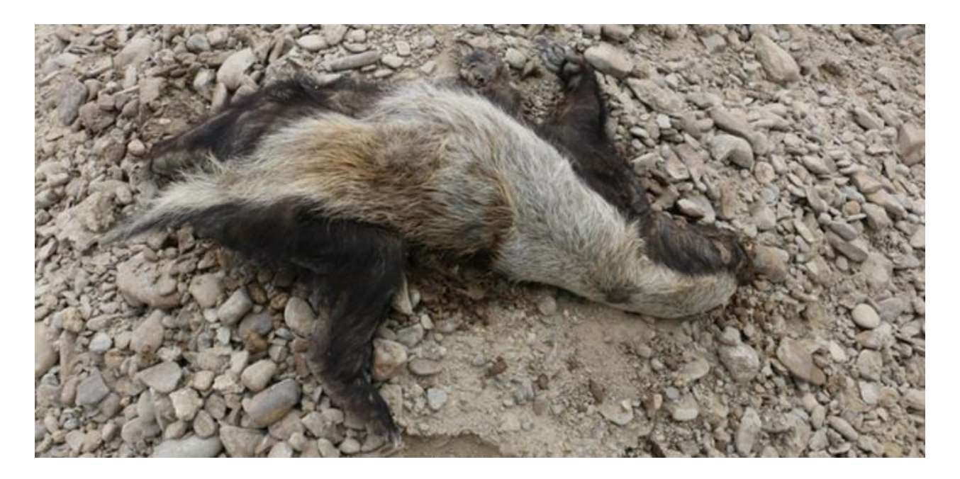
Figure 2. Dead Honey Badger, 1500 meters from Dampak village, Chabahar – Sarbaz road, Balushestan area, Iran 5 August 2016.