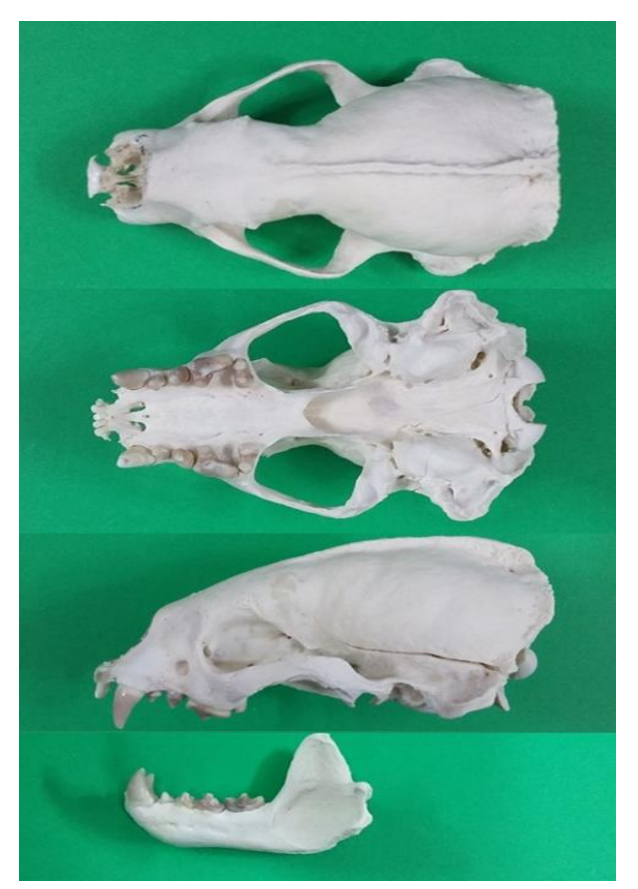
Figure 4 . Dorsal, ventral, and lateral views of cranial and lateral view of mandible of Mellivora capensis