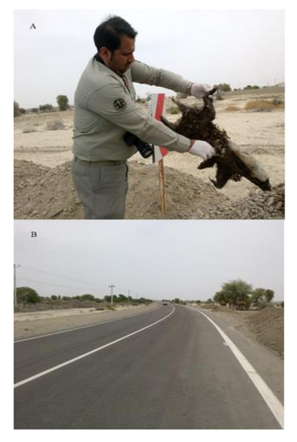
Figure 3. A: Dead Honey Badger B: Accident location Iran 5 August 2016, (photograph: A. A. Hosseini).

Figure 2. Dead Honey Badger, 1500 meters from Dampak village, Chabahar – Sarbaz road, Balushestan area, Iran 5 August 2016, (photograph: Ahmad Emami Zarandini).