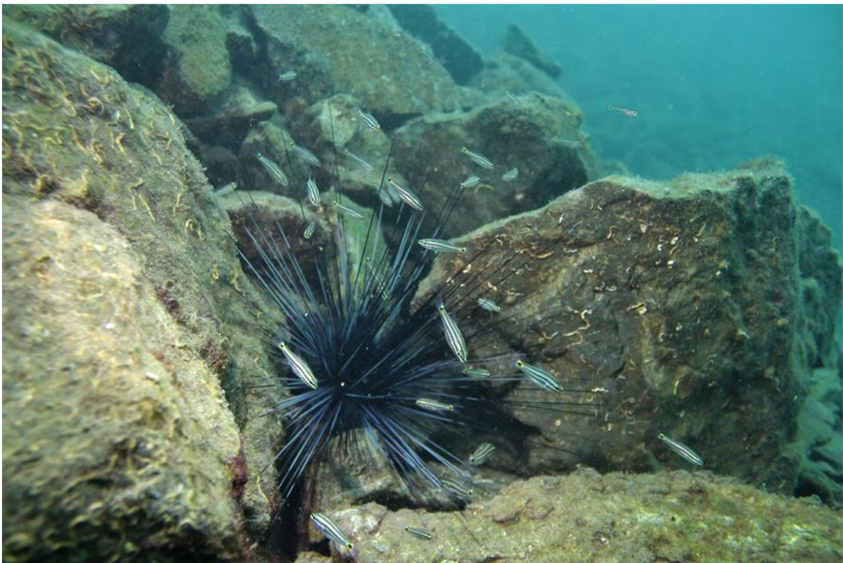
Figure 2. The symbiotic relationship between C. novemstriatus and D. setosum in the Gulf of Iskenderun

pectoral fin. There was a large yellow spot on both sides of the caudal fin, with a prominent black mark in the middle. There was another black spot on the dorsal part of the caudal peduncle. D. setosum was black with very long spines, but sometimes its color can vary to grey or white, or a combination of black, grey and white spines. This species has a red balloon-like bubble around the anus on its dorsal side (Coppard and Campbell 2006). It also has five white spots above the periphery of the test and blue spots arranged in lines.